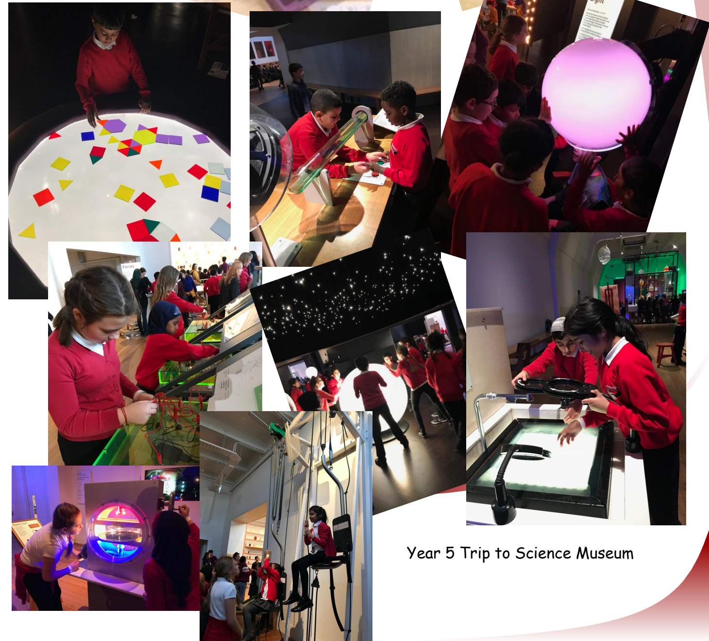
Year 5 Trip to Science Museum