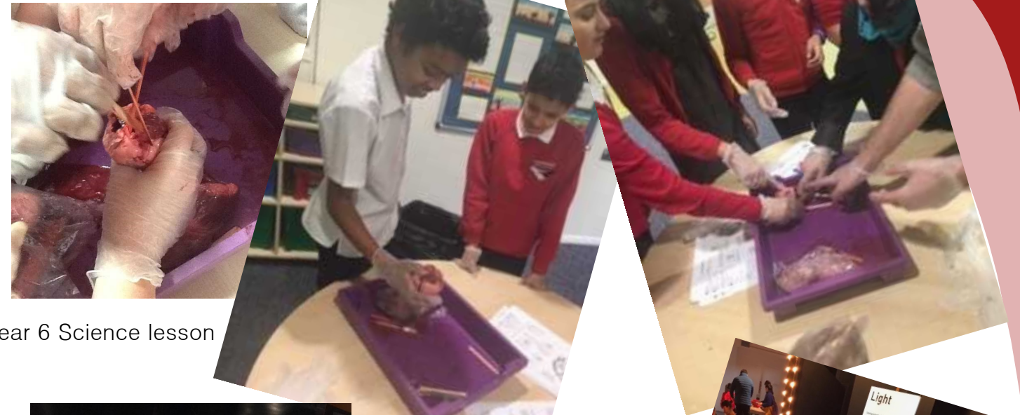
Year 6 Science lesson