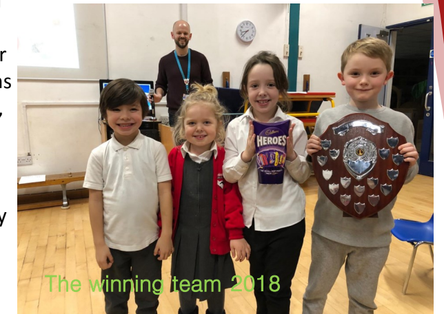
The winning team 2018