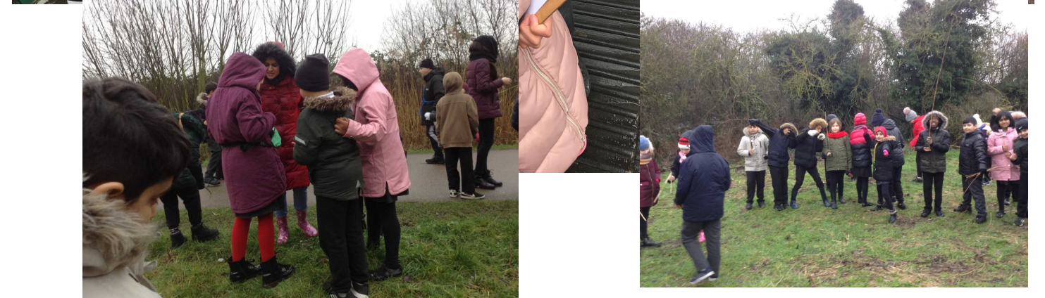
Bullfinch Class Assembly