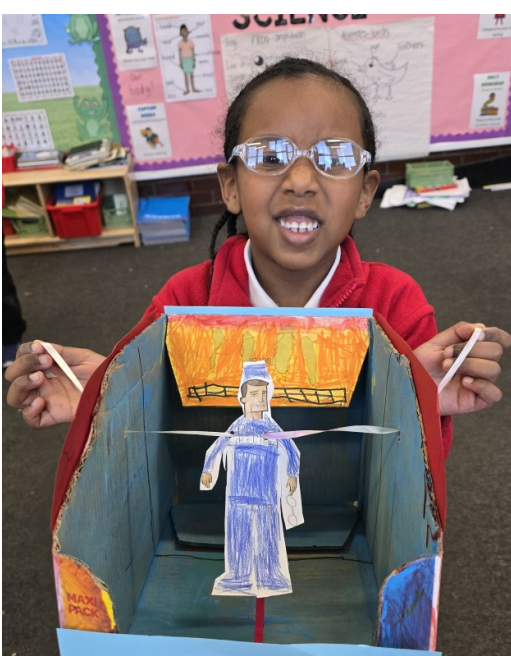
Year 1 traction man work!