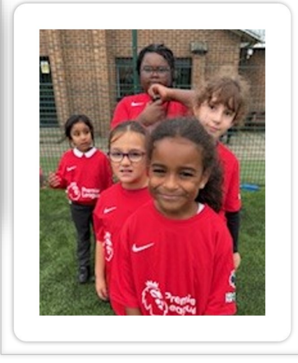
Just a few pictures to share what we have been learning this week .